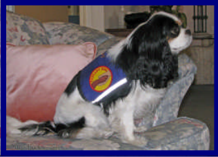
Missy, Agapé's Therapy Dog

Hospice palliative care is an important element to consider in any advance care plan. All Canadians have the right to die with dignity, free of pain, surrounded by their loved ones, in a setting of their choice.