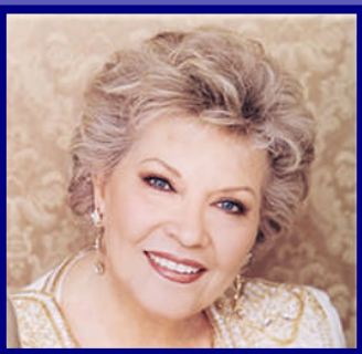
Legendary Patti Page serenades Agapé residents with her Tennessee Waltz

Canadian Hospice Palliative Care Association May, 2008